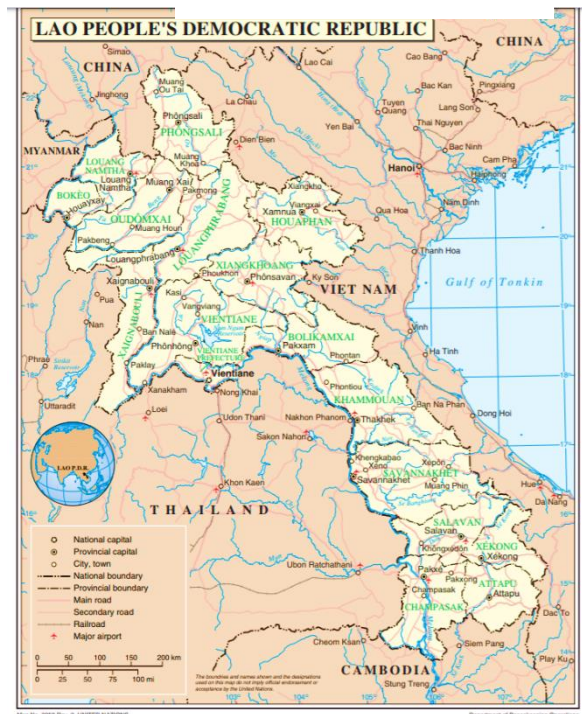
Map of Lao PDR

The lockdown restrictions were loosened effective 4 May although inter-provincial travel remains restricted. Based on the notice from the Prime Minister's Office, additional restrictions may be re-imposed by the government if new cases are detected. If an infected case is confirmed in a particular province, stricter measures will be enacted in that province. If a cluster of cases is found in two bordering provinces, then the country may revert to stricter lockdown measures stipulated under Prime Ministerial Order No. 6/PM. 4