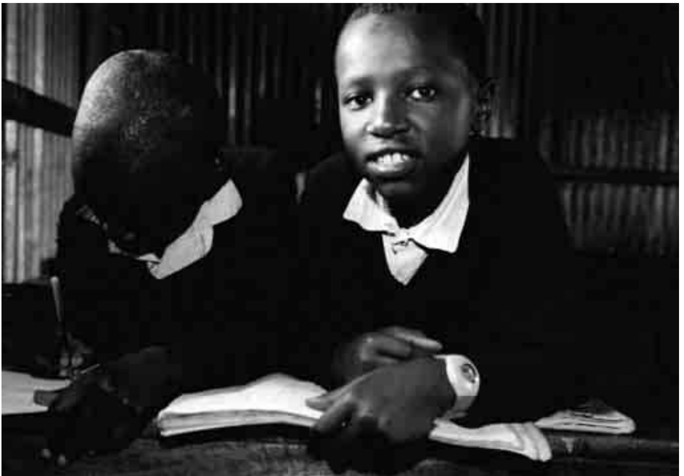
Boys at school in Kenya