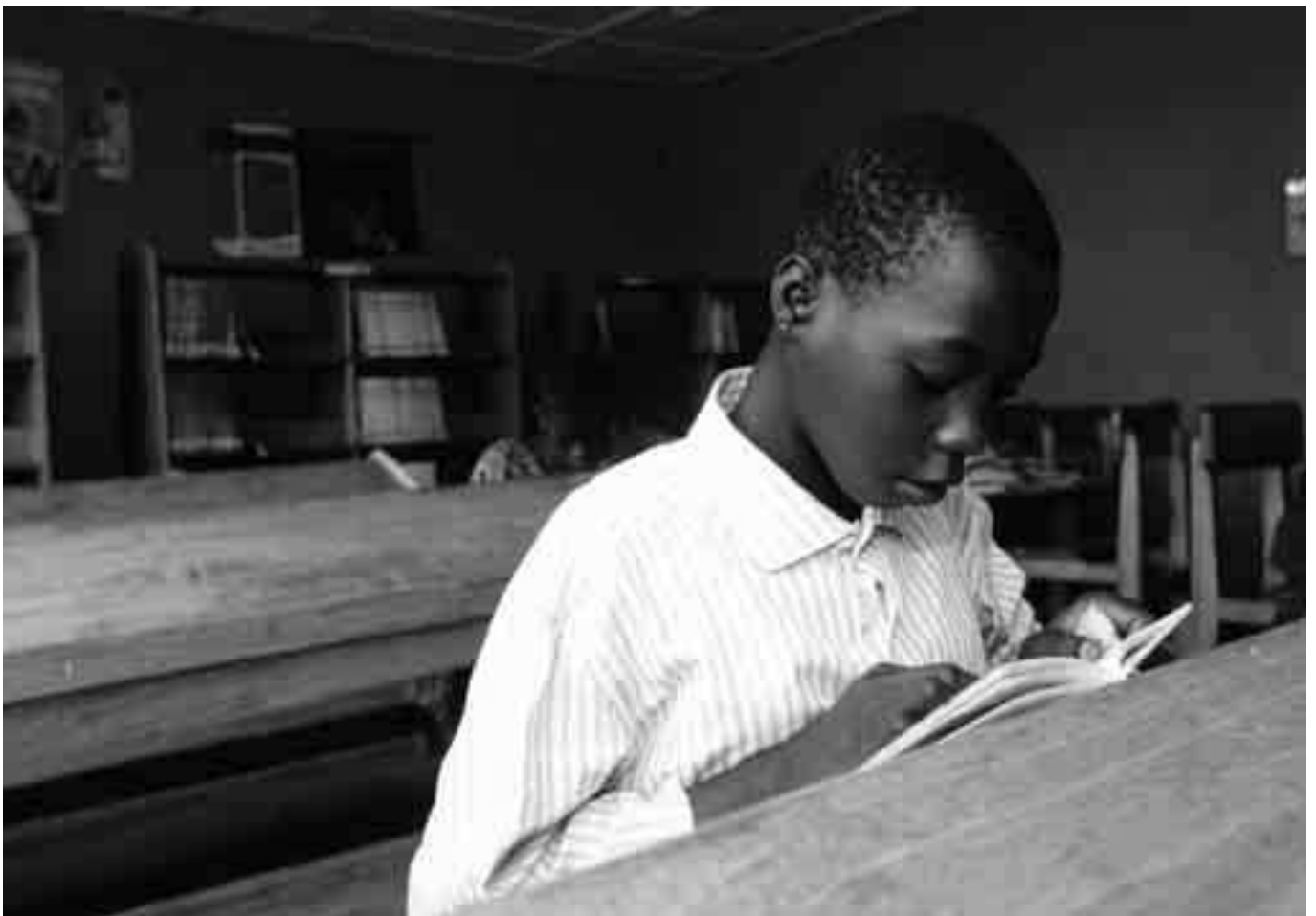
Boy reading in Ghana