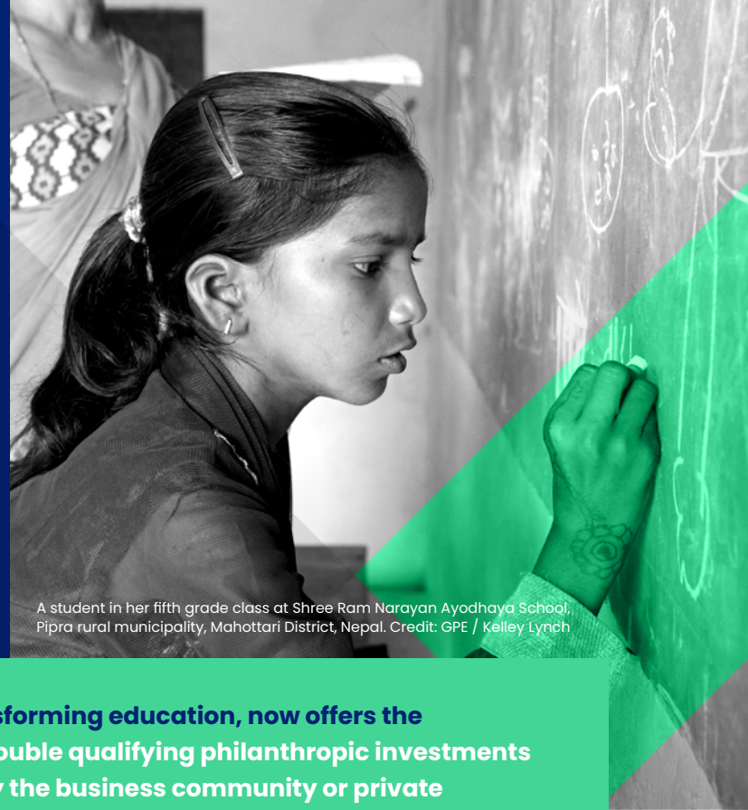
A student in her fifth grade class at Shree Ram Narayan Ayodhya School, Pipra rural municipality, Mahottari District, Nepal.

A 1:1 Match for Investments in Education in the World's Poorest Countries