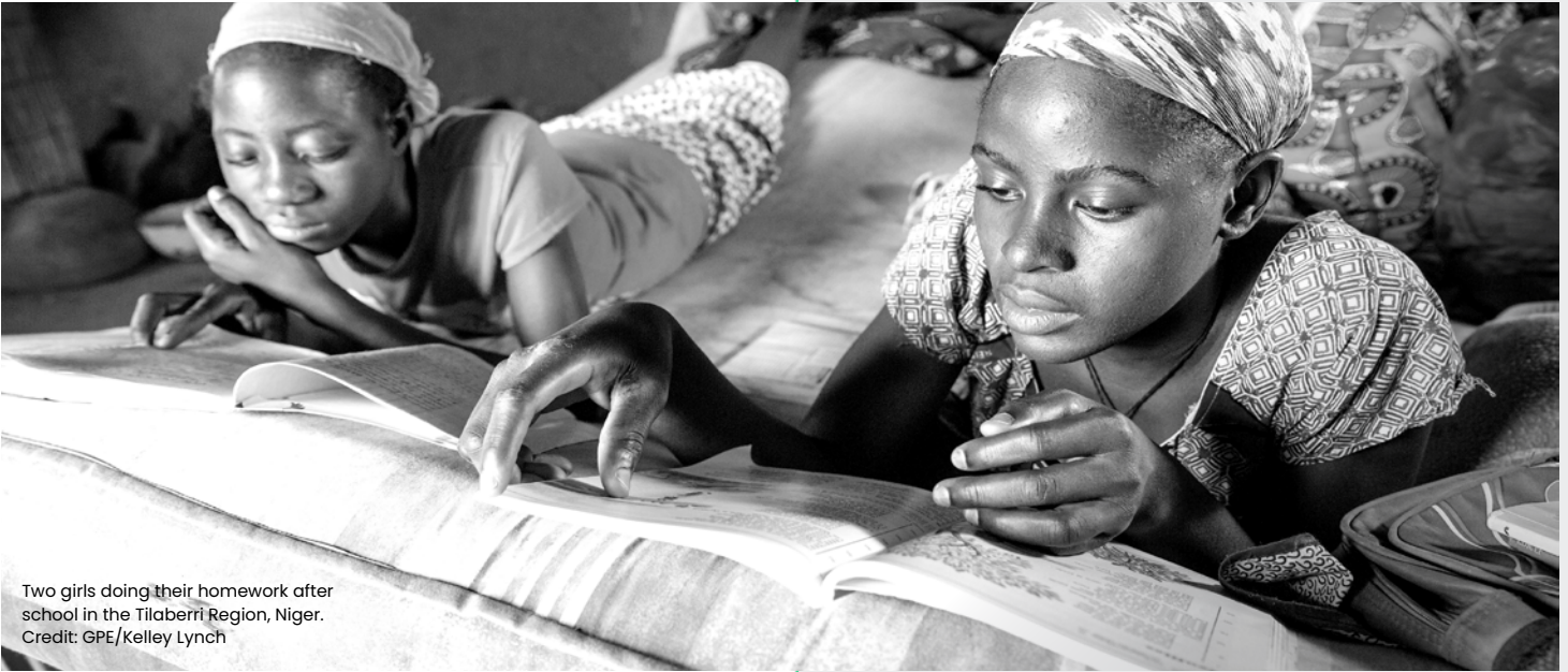
Two girls doing their homework after school in the Tilaberrri Region, Niger.