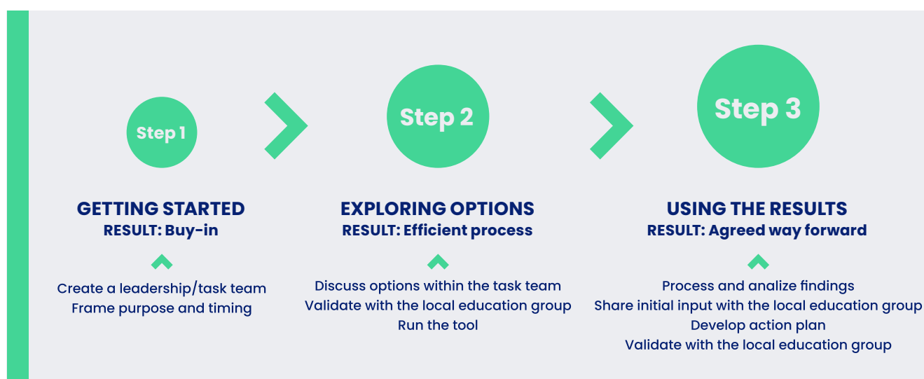
Figure 2. Overview for conducting the assessment