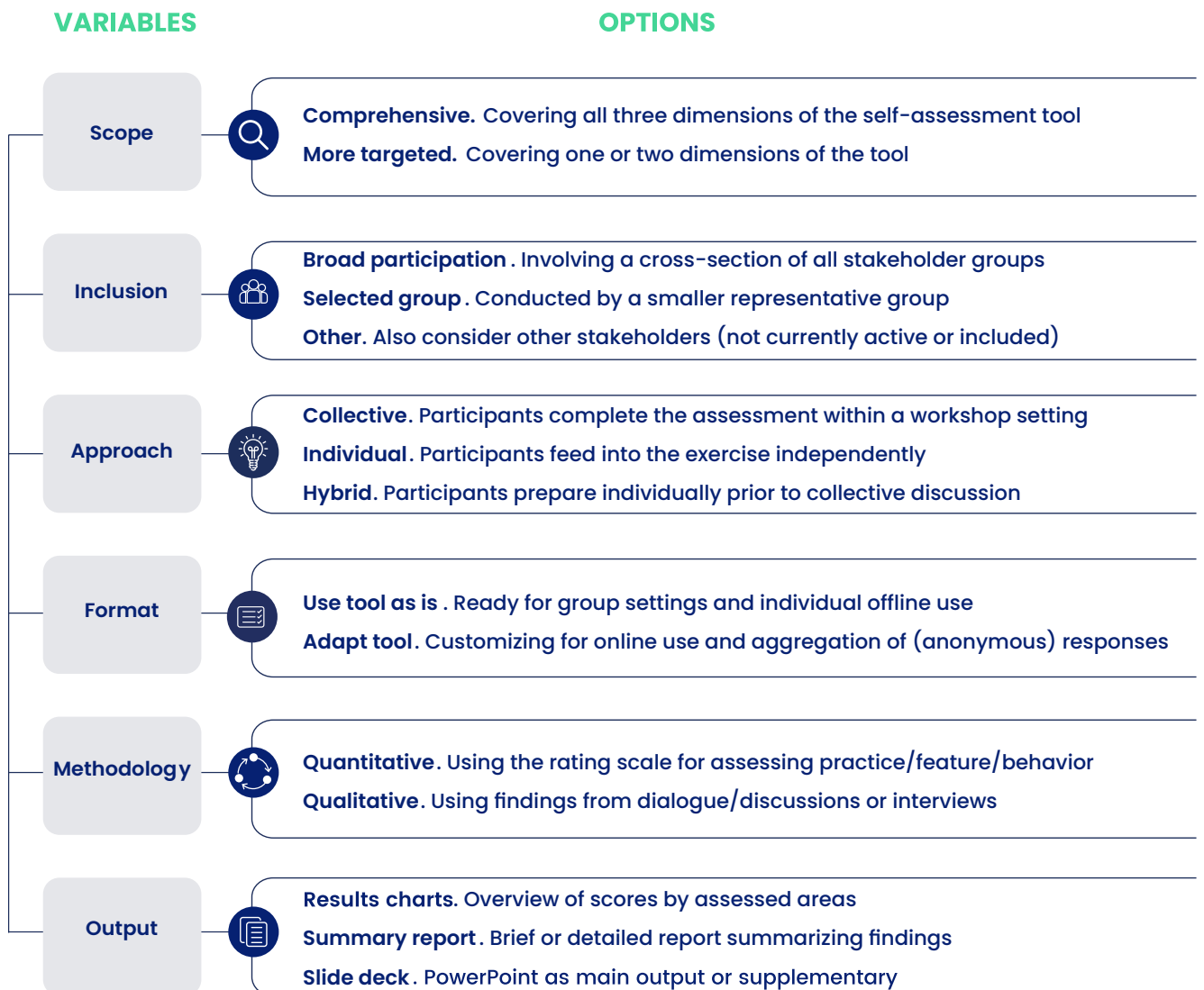
Figure 3. Overview: Options for conducting the assessment

The guidance in figure 3 can be used by the team to plan the exercise. This should also include discussion on how insights and outputs will be used to support the review's intended purposes.