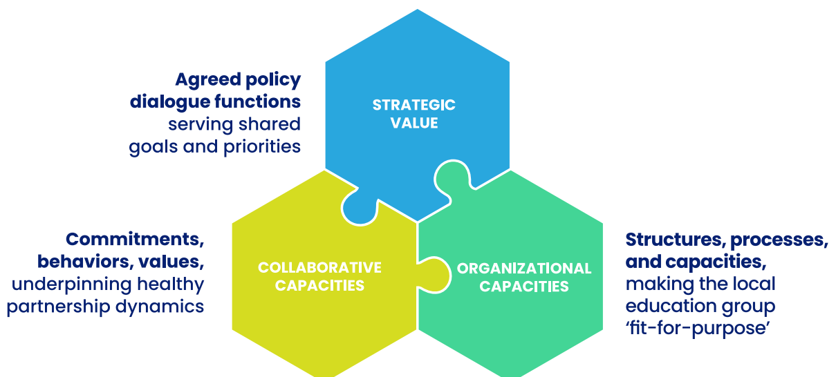
Figure 1. Three dimensions of local education group effectiveness

Through the GPE Effective Partnership Rollout , the tool has been trialed over a six-month period with the engagement of stakeholders in 14 partner countries and subsequently revised following user feedback. It can be used by all local education groups (or equivalent mechanisms for policy dialogue and sector coordination) – irrespective of current sector dialogue and coordination practices, whether the local education group is emerging or well defined, and how well it is functioning – and is structured around three core dimensions (see figure 1) associated with effective multi-stakeholder partnerships. Each of these dimensions contains features that are considered important to an effective education group and are examined through use of the tool. This diagnostic exercise is intended to be a self-assessment , meaning that it is undertaken by stakeholders themselves, as opposed to being conducted by a third party (external).